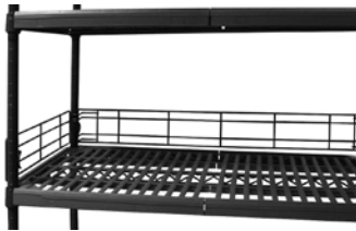
*Green Epoxy Style